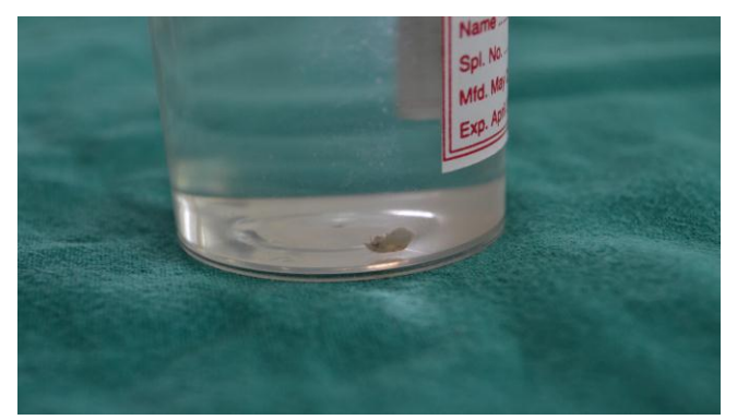
Figure 2 – Biopsy specimen